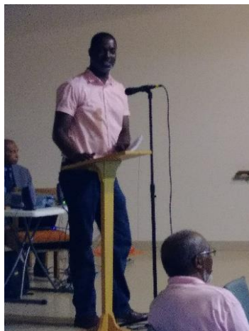
Awards presentation at John Knox